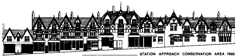
STATION APPROACH CONSERVATION AREA 1992