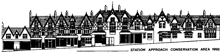
STATION APPROACH CONSERVATION AREA 1992

120 Highlands Road, Shirley, Solihull B90 4BW Tel: 0121-733 5222