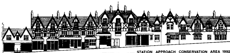
STATION APPROACH CONSERVATION AREA 1992

824, Stratford Road, Shirley, Solihull. Tel: 0121-733 5222